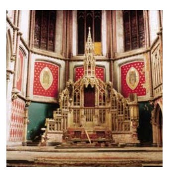
The High Altar before restoration