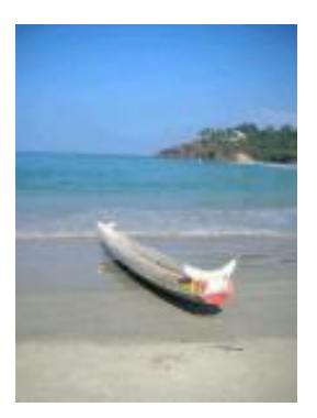
The beautiful Kovalam beach, in Kerala