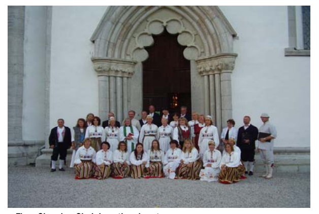
Flora Chamber Choir in national costume

Flora tour concert dates: Friday 18 May, 8.00 pm Emmanuel Church, Didsbury and Saturday 19 May, 7.30 pm St George's Church, Poynton Joint Concert with St George's Singers